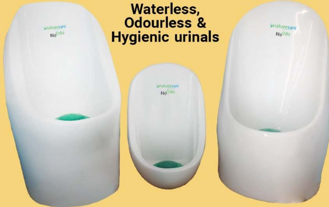
Male Adult Model1