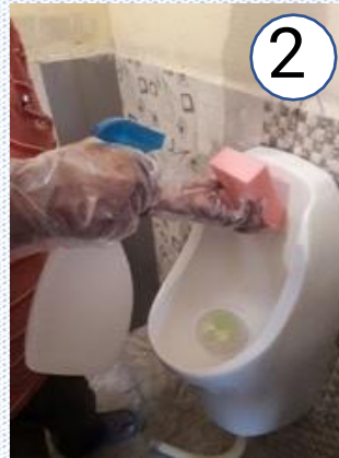
2 Spray 'naturesani Bio-Spray' all over the basin and wipe it with a sponge/cloth