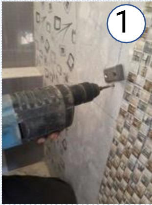
1 Mark and Drill Holes after measurement