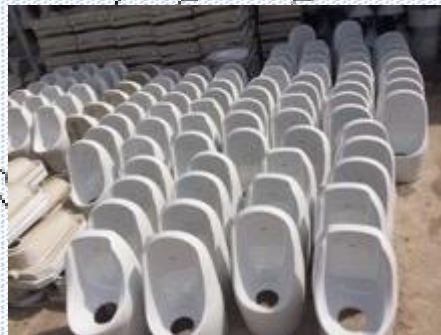
Units kept for drying