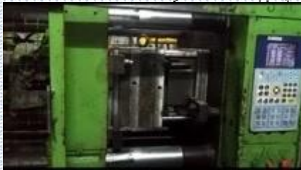
Cartridge moulding Machine at the factory