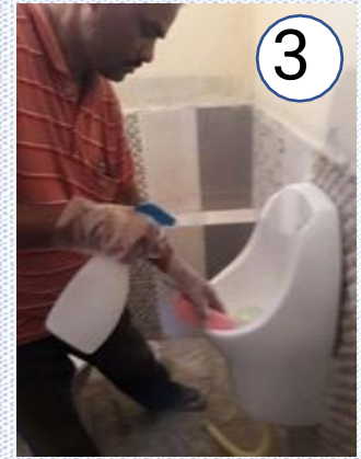
3 Spray some 'naturesani Bio-Spray' on the cartridge and basin for it drain through it