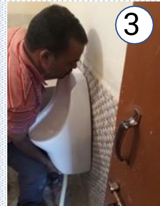
3 Mount the Ceramic basin with the pre-installed cartridge on the mounting brackets