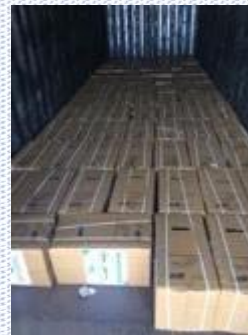
Ready to be shipped units