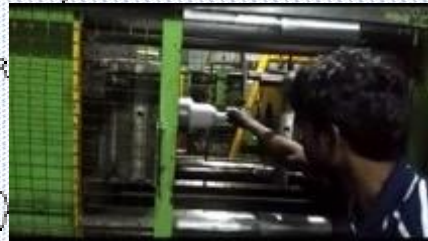
Cartridge moulding in progress