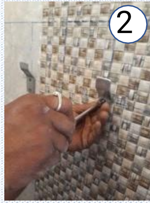
2 Insert the correct size wall bits in the wall and tighten the screws provided through the 2 wall brackets